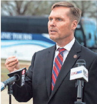
Sen. Cindy Hyde-Smith, top, and U.S. Rep. Michael Guest, above, have voiced their support for President Trump's decision to bomb Iran.