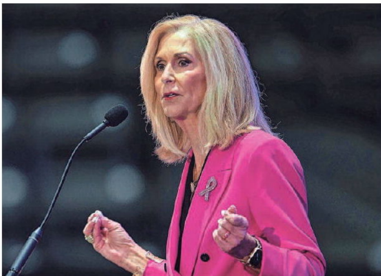
Attorney General Lynn Fitch posted on social media: "This is the pathway to sustainable peace in the Middle East. Thank you, (Donald Trump), for showing how to deal with a bully. May God watch over the men and women in uniform and may God continue to bless the USA."